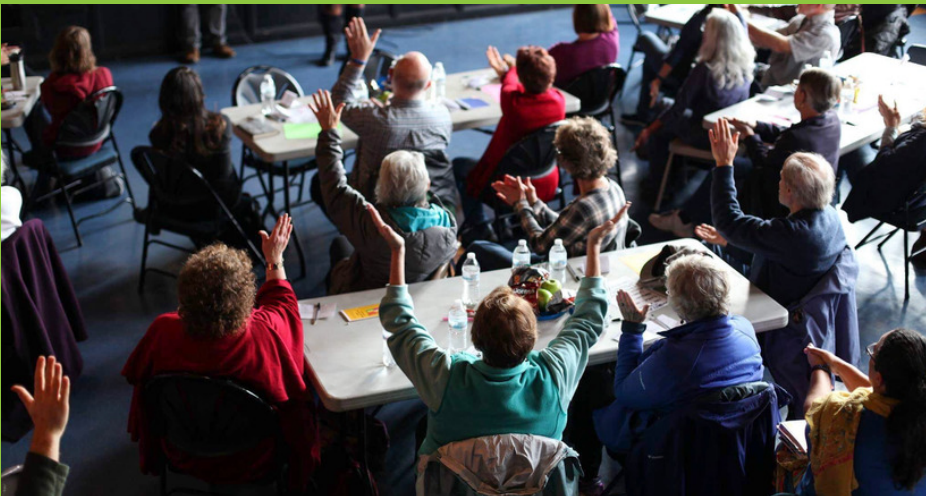
Top - Brazilian Dance Troupe at the Cultural Event Series' Delridge Day Bottom - Participant reactions at Cultural Event Series' Race: The Power of An Illusion Film Screening

This project was funded in part by a Neighborhood Matching Fund award from the City of Seattle's Department of Neighborhoods.